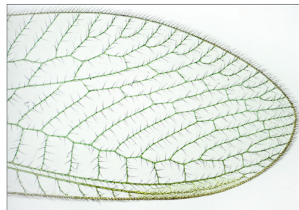
Green lacewing Transmitted light brightfield